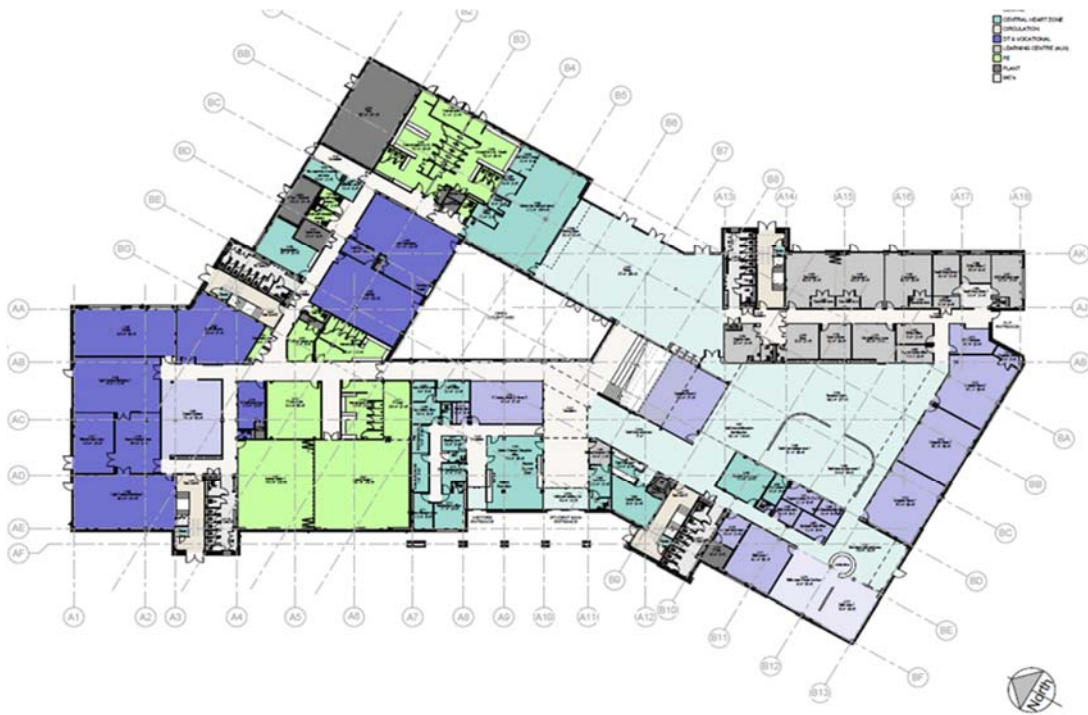
Caldicot School – Ground floor plan