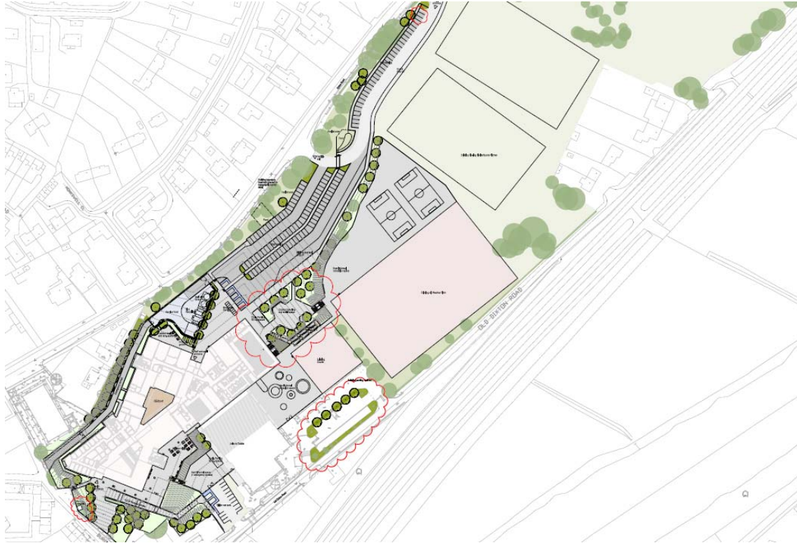
Monmouth Comprehensive – Site Plan