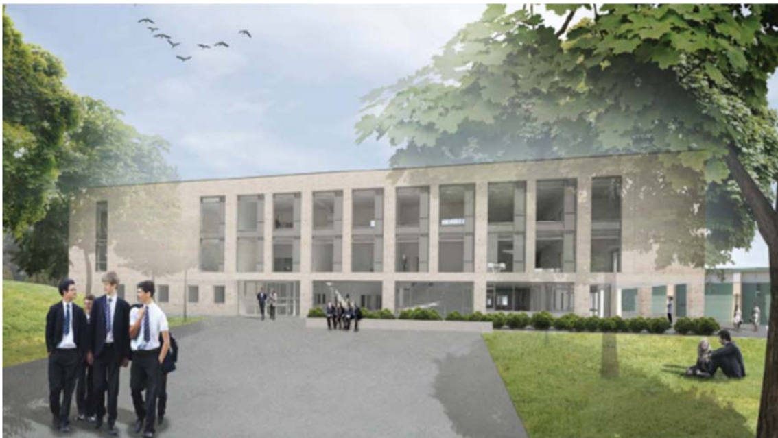
Monmouth Comprehensive – School entrance – visual