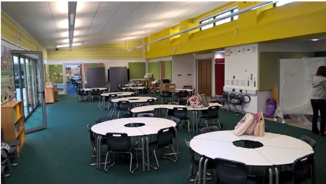
Internal view of the new school – YR3 /4 Plaza.