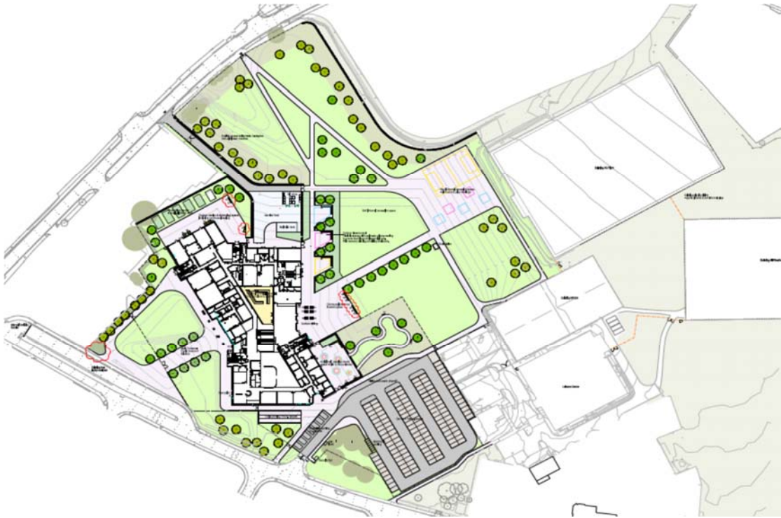
Caldicot Site Plan.