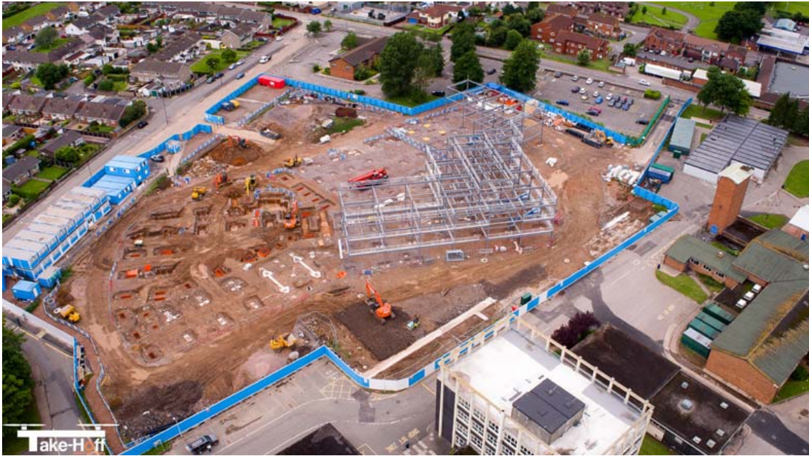
Ariel view – New Caldicot School in construction.