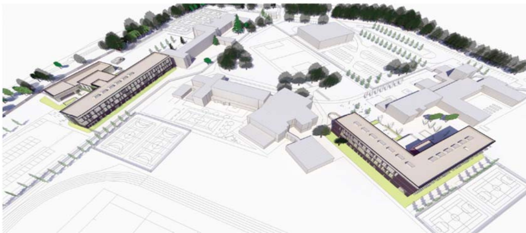
Ariel Perspective .