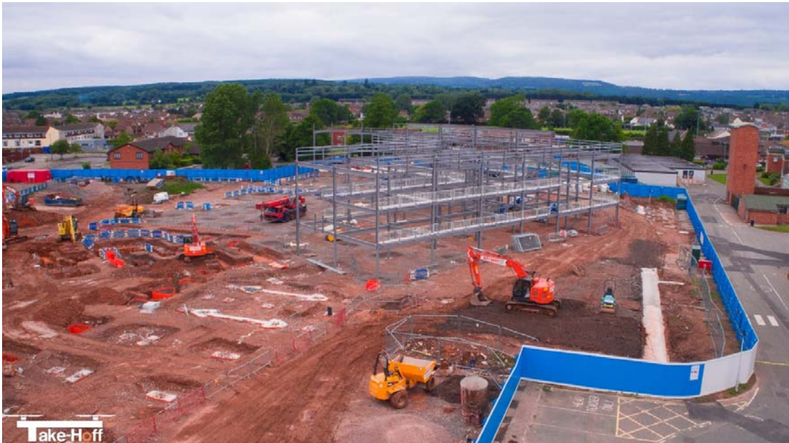
Ariel view – New Caldicot School in construction.