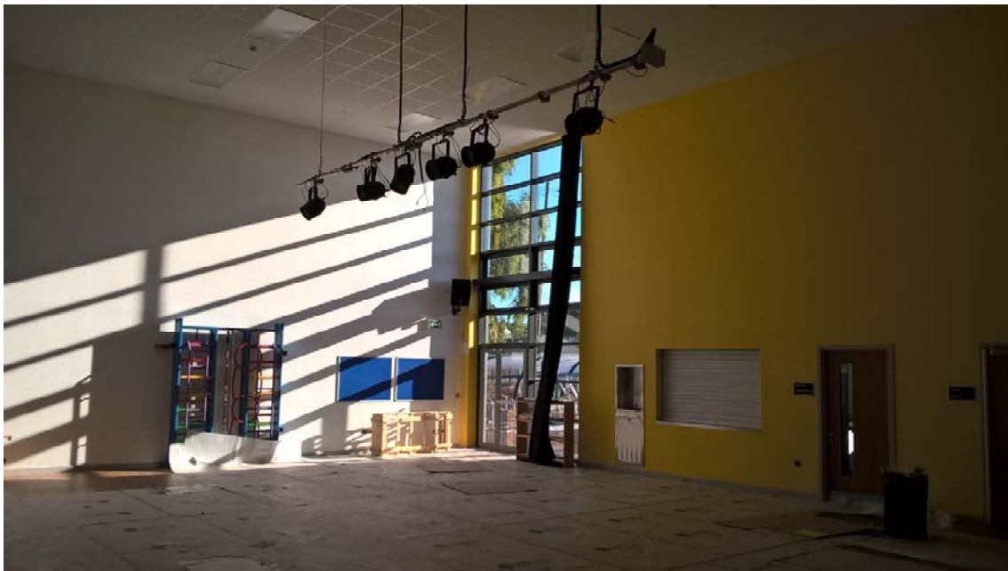
Main School Hall