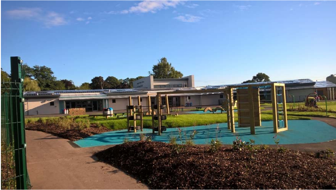
View of the new school from the soft play area.