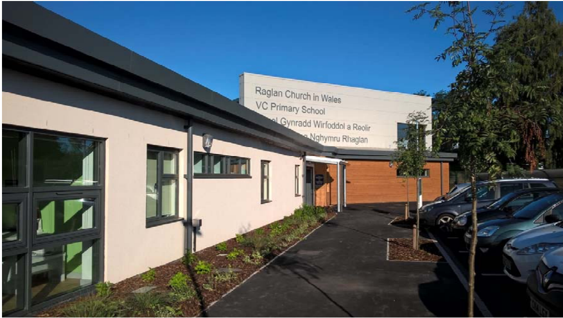
View of the front of the new school.