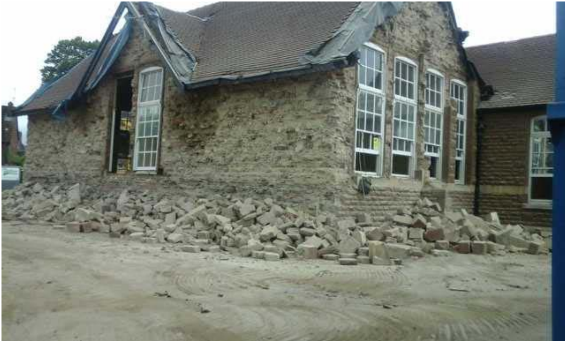
Demolition of the original school building – Monmouth Comprehensive