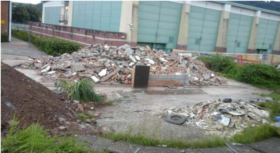
Drama department demolished – Monmouth Comprehensive.